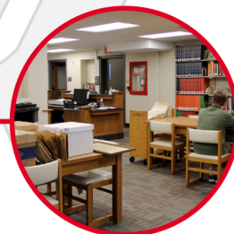
Archives and Rare Books Library