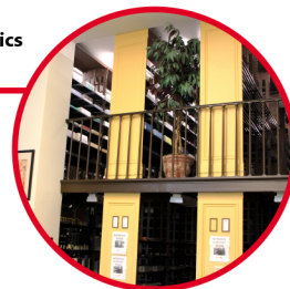
John Miller Burnam Classics Library