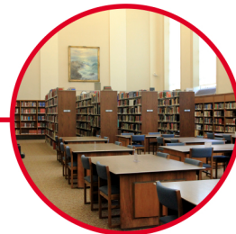
Albino Gorno Memorial Library/ CCM Library