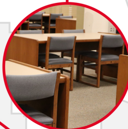
College of Education, Criminal Justice and Human Services Library