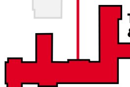
Teachers' College & Dyer Hall