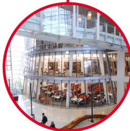
Donald C. Harrison Health Sciences Library