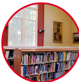
Geology-Mathematics- Physics Library