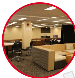
Ralph E. Oesper Chemistry- Biology Library